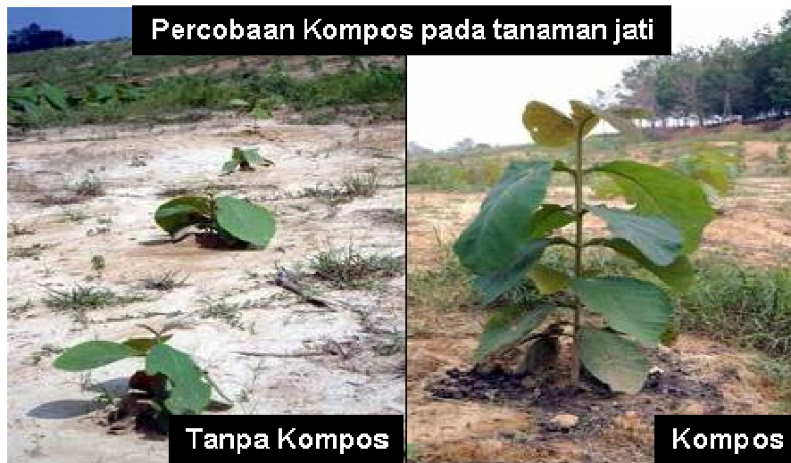
Without Bio-Organic Fertilizer