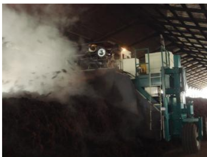
TKKS enumerator machine

*Contents of BUMI Bio-Organic Fertilizer: