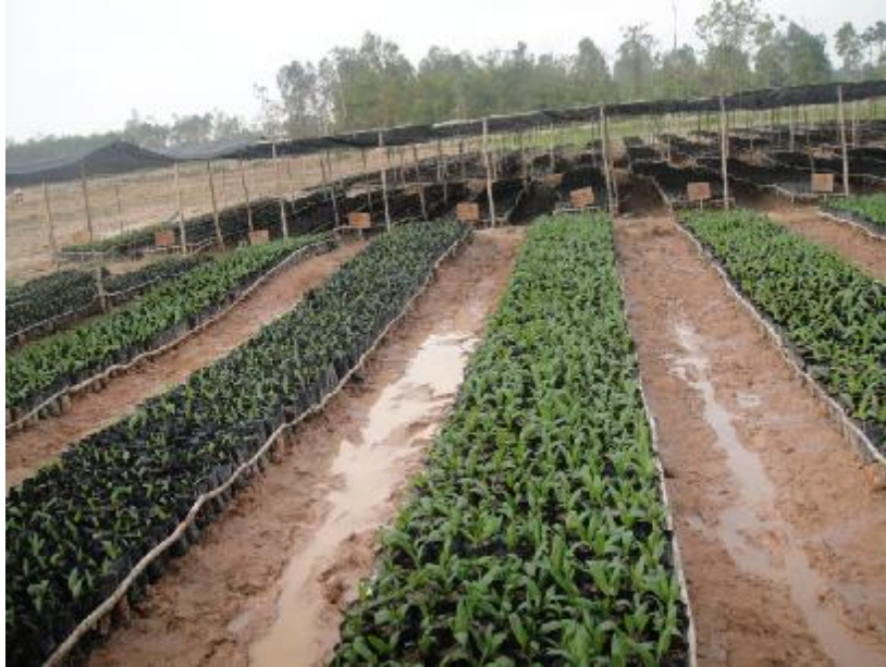
Healthy and green palm oil seeds growth with the application of BUMI Bio-Organic Fertilizer.