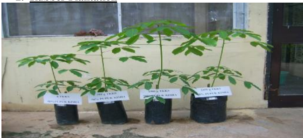
Q of Bio-Organic Fertilizer