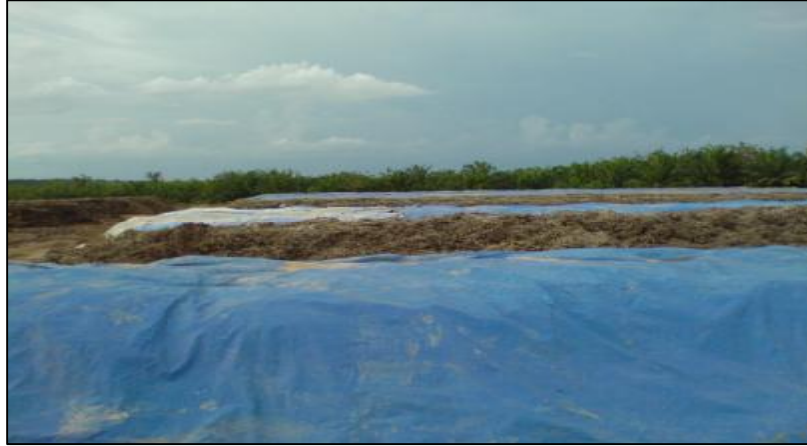
Bumi Bio-Organic Fertilizer Factory

Compost is the source of organic material for soil as well as source of nutrient for plant. PT. Bumi Sriwijaya Sejahtera introducing BUMI Bio-Organic Fertilizer which is made from palm oil empty stem / Tandan Kosong Kelapa Sawit (TKKS).